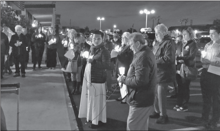
A file photo from last year's Solidarity Walk to end human trafficking.