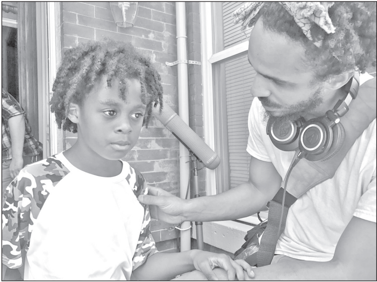
Jay continues to meet with residents of Q Street meticulously taking notes that he will turn into a screenplay.